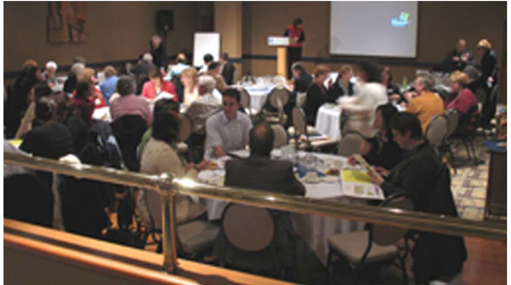
Some participants at the Roundtable Nov. 3, 2006

The Society provides other services beyond transportation. They will recommend qualified service providers to assist members with household duties (yard work, snow shovelling, small plumbing and electrical, etc.). Volunteers manage phones and volunteer drivers must have $1,000,000 liability and their own vehicle. ■