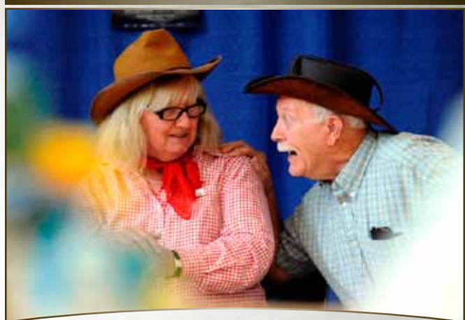
Festival of Edmonton Senior Theatre (FEST) participants perform as part of CAF 2009

The 2010 Creative Age Festival will take place June 8 to 16. Information about the festival will be shared with ESCC members as organizational efforts give shape to its events and activities. For information visit www.creativeagefestival.ca .