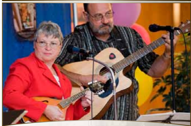
Art Café performers for CAF 2009