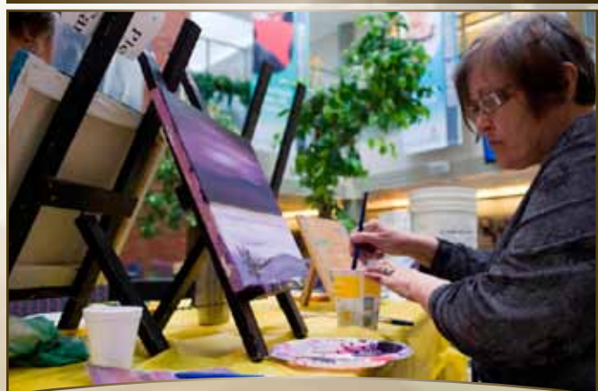
Acrylic Painting Workshop participant at CAF 2009