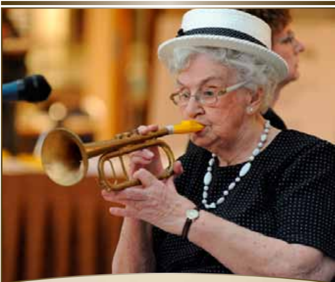
Art Café performer for CAF 2009