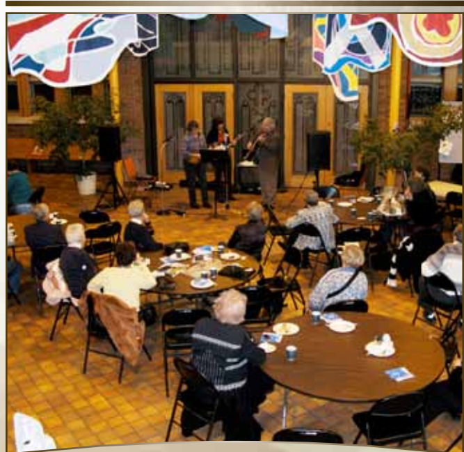
2009 Seasonal Celebration